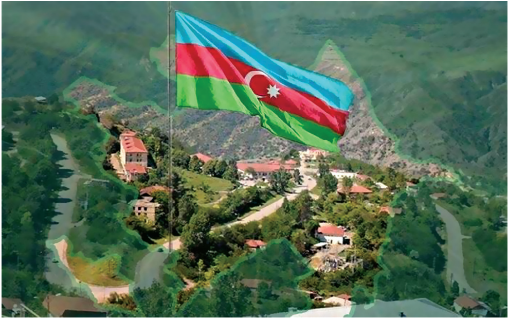
Fig. 1. Victory Road.