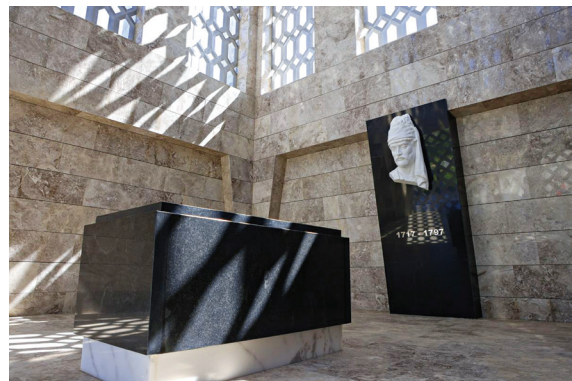
Fig. 7, 8. Mausoleum of the poet and statesman MollaPanahVagif. After restoration.