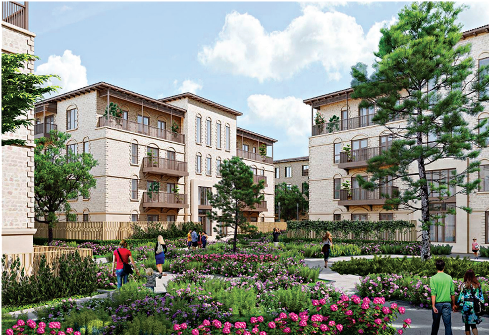
Fig. 3, 4. Residential buildings in Shusha will be like this.