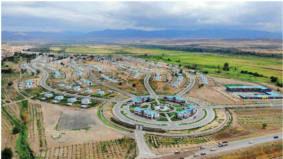
Fig. 10. Real construction of the village of Aghali