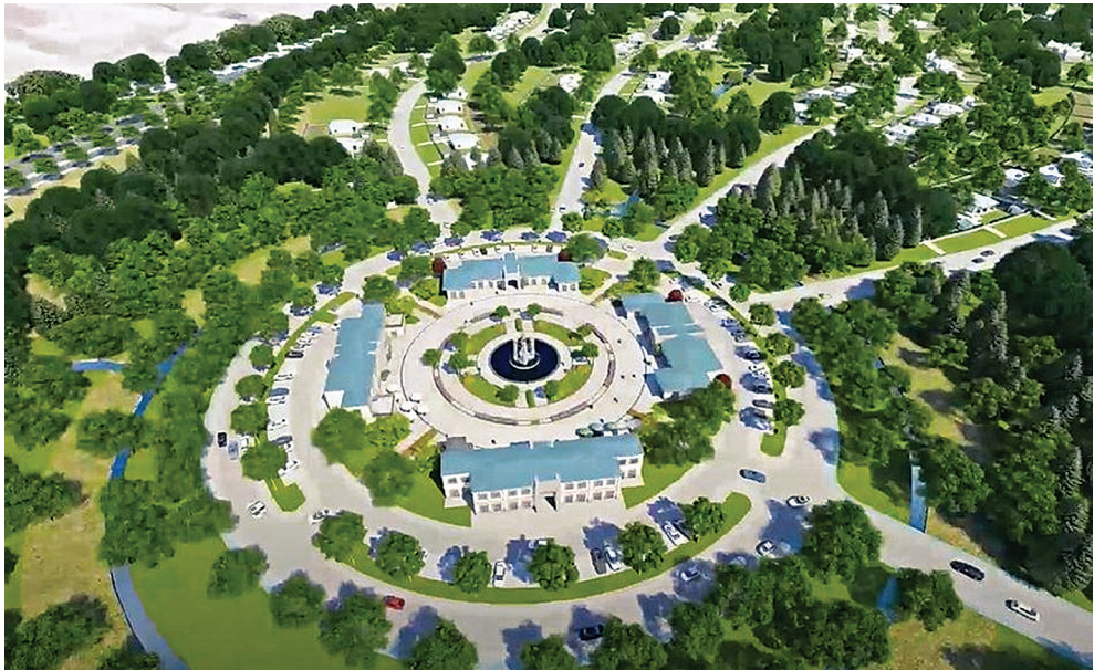
Fig. 9. The project for the village of Aghali