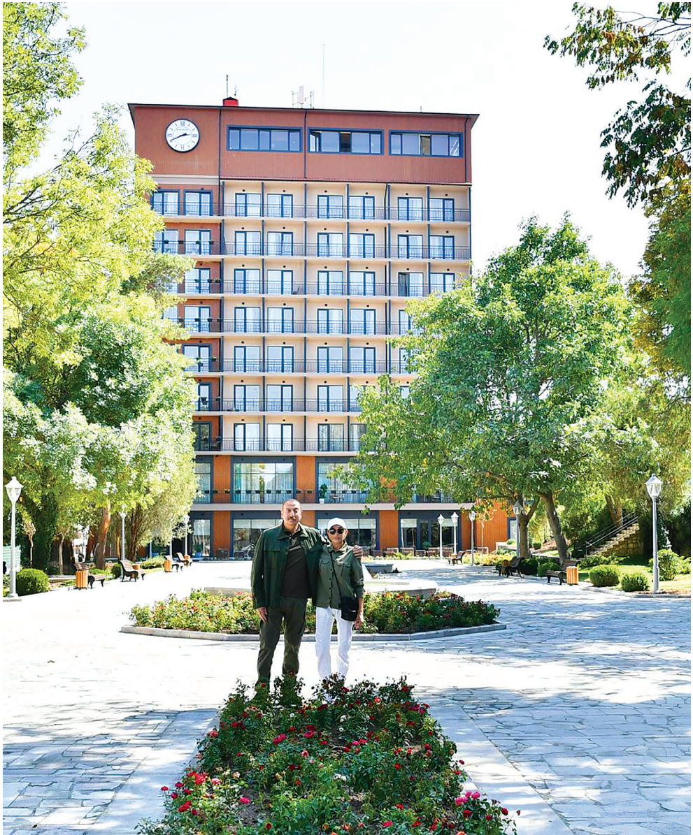
Fig. 5. President IlhamAliyev and First lady MehribanAliyeva at the opening ceremony of “Karabakh” hotel in Shusha.