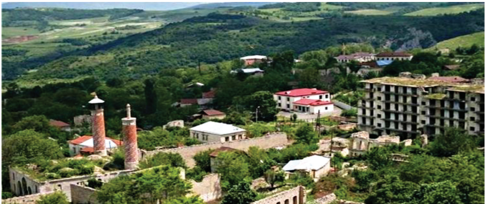
Fig. 2. Shusha after the occupation.